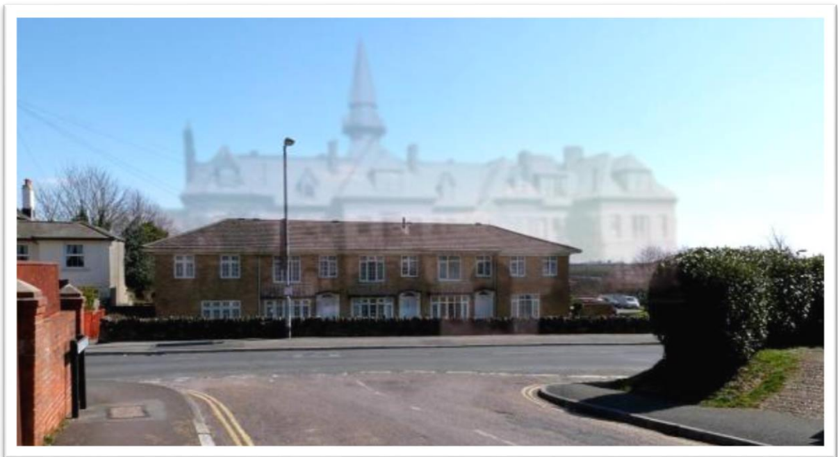
In Memoriam BOB@ wootton

The building remained empty until the 1950s when it was finally decided to demolish it. It then became a residential close for a number of new buildings. The photograph below has been inset with how it would have looked then and now.