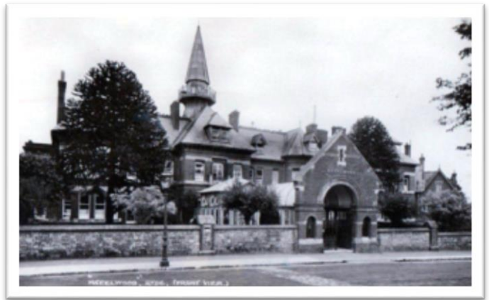
Hazelwood House.